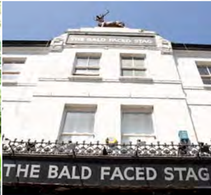
East Finchley Archer