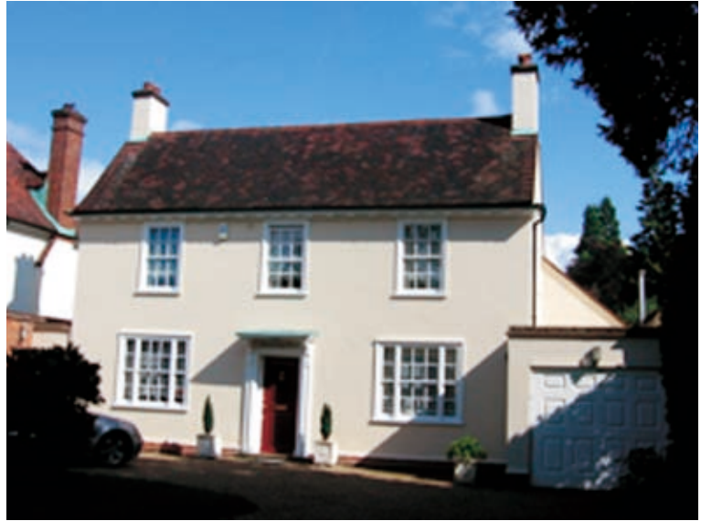
A very good example of neo Georgian design along Hadley Green Road

Hadley House Cottage provides a focal point alongside Hadley House which was built a grand scale, in majestic Georgian style. Apart from the listed, high walled garden of Hadley House, the rest of Hadley Green Road has prominent railings or low boundaries which emphasise the strong relationship that these properties have with the Green. There are further striking, stuccoed and red brick Georgian properties along Hadley Green Road which are mainly listed. The properties Fairholt, Monholt, Monken Cottage, Livingston Cottage, Northlands, Hollybush House and Grandon are notable as a group, due to their attachment and colour, ending with the Wilbraham Almshouses. These are a group of six, early 17th century, red brick cottages. The almshouses are particularly noticeable due perhaps to how unusual they look in contrast to surrounding properties being single storey but extending in length with their steep roofs and diagonally placed chimneys (although the chimneys are not considered to be the original construction, they may replicate them). They mark the beginning of a funnel like access where the road bends and meets with Dury Road and bends invitingly to the village centre. There is a good view here of Hadley Bourne from Hadley Green Road.