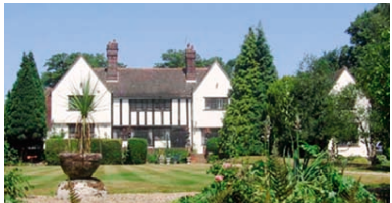
No. 109 Camlet Way, White Webbs

The land to the north of the properties in Camlet Way and area five is almost completely undeveloped agricultural land, included in the Green Belt. There are clear field boundaries seen in area six to the northern-most tip of the Conservation Area. Rectory Farm