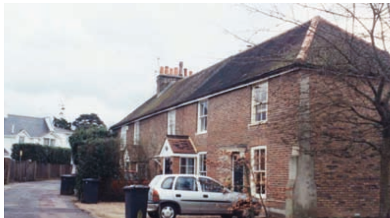
Nos. 10-18 Games Road

Nos. 10 to 18 Games Road are an attractive terrace of modest cottages, built in 1750. Front porches have been added to most of the properties. They have no formal boundaries. Outside of no. 10, marking the most easterly edge of The Common, is one of five wooden gates which stand at the access points to The Common. Originally erected in 1824, this white painted, five bar timber gate is included on the statutory list.