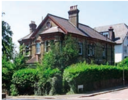
No. 1 The Crescent

This area directly adjoins area seven continuing along Hadley Common. On the undeveloped side of the Common it is now entirely wooded (Hadley Woods). On the developed side, The Crescent is set back and highly screened by trees and vegetation and is marked by two listed access gates (of five gates) which mark the enclosure of Hadley Common. They were previously used to prevent grazing animals from straying into residential streets. The Crescent does represent a change in the built form from the luxurious villas of area seven to the beginnings of the more suburban type of development to the south of the Conservation Area boundary. The Crescent contains some interesting Victorian architecture as well as mock Tudor and Georgian.