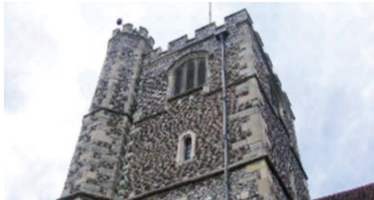
Church of St Mary the Virgin, village centre

There are strong tree-lined boundaries defining the route along both sides of Hadley Green Road up to the site of the church. On the church side of the road the houses are set back, with a wide pavement and wider pedestrian access, while on the other side is dense vegetation with a narrow pavement and providing pedestrian access.