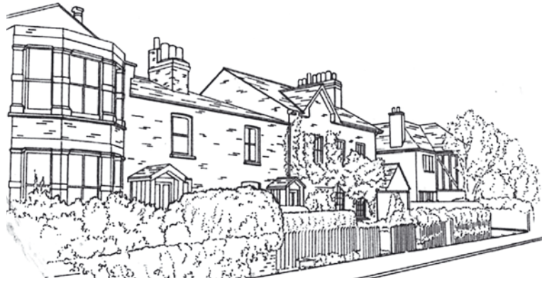
Cottages lining Kitts End Road

Hadley Highstone (part of the Great North Road). The Highstone obelisk is at the junction of Kitts End Road and Hadley Highstone. The stone, as noted earlier, commemorates the Battle of Barnet, was moved here in 1840 from its original position some 200 yards further south.