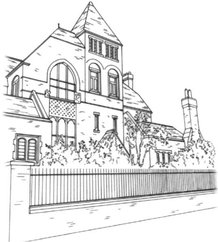
Monkenhurst, The Crescent

To the south of The Common and to the east of The Spinney is the Tudor Sports Ground and Golf Club, which is included within the Conservation Area boundary. Although these are two differing types of open space, the golf course is screened with a few glimpsed views by wooded vegetation and the area appears almost entirely rural. The road ends in a car park at the golf course and there is a bridlepath which continues through to the very eastern end of The Common/Hadley Woods and the Conservation Area. The railway line crosses The Common just after the car park area (the railway line is not part of the Conservation Area).