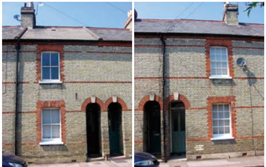
Properties in Chipping Close

Opposite the market in Chipping Close stands a terrace of small, brick built two-storey cottages. These houses have pitched roofs, a single window on each floor and an arched recessed entrance, which offers the only defensible space. They are in keeping with the predominant height of local properties and present a virtually unaltered face to the street, retaining most of their original features.