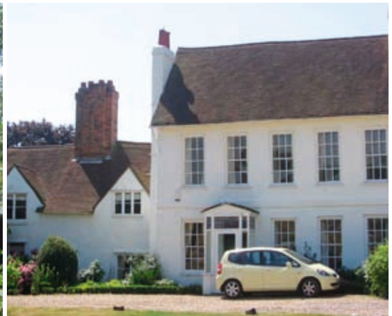
Hurst Cottage, The Common The Common

There is also a listed barn within the grounds of Gladsmuir and the front boundary wall adjoining Gladsmuir to Hadley Lodge is listed in its own right.