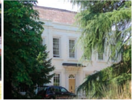
The Chase, The Common