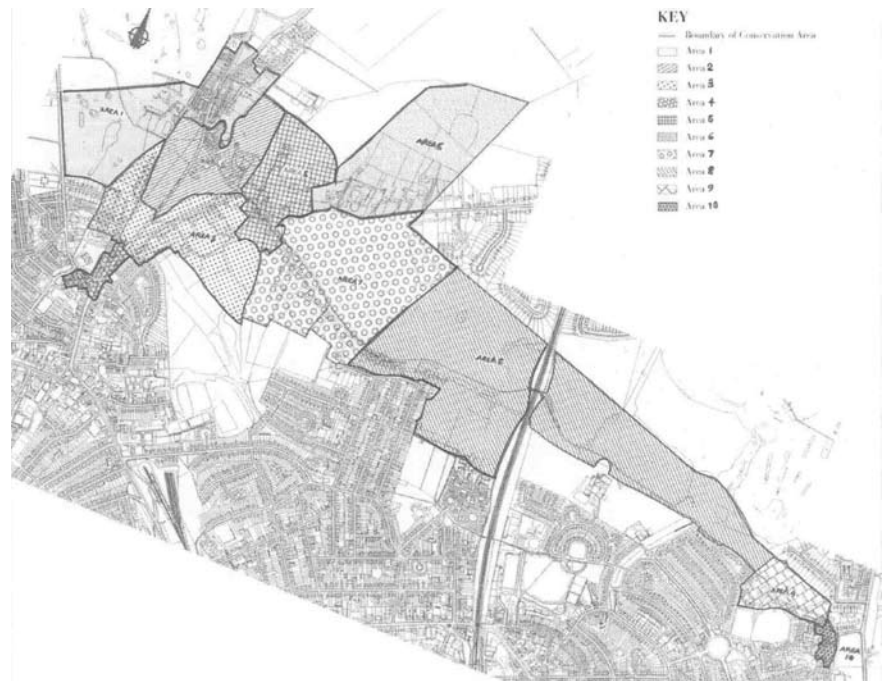
The division of sub-areas in Monken Hadley

Therefore, it is suggested that the reader looks at the individual character analysis below (seven) for the particular local area they are interested in to define local styles, materials, textures and colours.