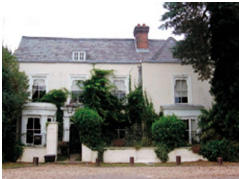
Pymlicoe House and Hadley Green West

7.3 Area three - Hadley Green Road West and Hadley Green Road The Great North Road is flanked on both sides by the Green. This part of the main throughfare in Monken Hadley has no built elements except for the access to the listed Pymlicoe House and Hadley Green West. Originally, the line followed by Hadley Green West and Kitts End Road was the main route through the area. Pymlicoe House, which stood on this earlier route, is a stuccoed Georgian property which can be admired through the scattered vegetation from Hadley Green.