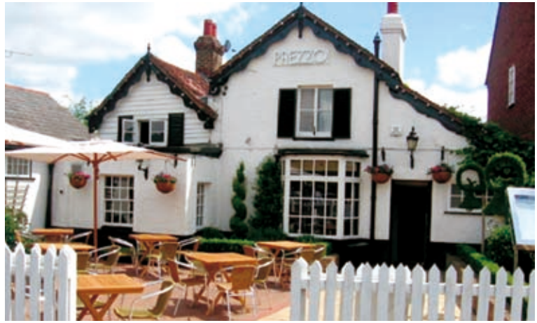
18 Great North Road (listed 17th century former coaching house)

Taylor's Lane leads off Hadley Highstone (on the west side), around to Old Fold Lane and contains pretty, modest cottages notable as a group and built in close proximity. There is a strong front boundary. Nos. 7 and 8 are locally listed. There is a strong front boundary. Nos. 7 and 8 are locally listed. Old Fold Lane contains a group of attractive Victorian terraced properties on one side only, facing the high boundary vegetation of the golf course, although, there are glimpsed views beyond. This part of the Conservation Area is characterised by restricted road widths and a tighter urban grain. This opens out at Old Fold Close and further more onto the Green itself. Old Fold Close branches off from the lane and contains handsome locally listed properties. They are quite enclosed by a strong boundary of trees and shrubs with glimpsed views of the houses from all angles. There are direct views into the close from the lane. On the opposite side is the listed Old Fold Manor Golf Club House, two houses of c1820. It was adapted in the early 20th century by Charles Weymouth as a clubhouse with an added central link with four columns. Next door, the listed Old Ford Manor House of c1750 is also a fine stuccoed five bay building which can be glimpsed from the lane through its boundary vegetation. There are the remains of a moat to the west. The Manor faces (although set back) onto the Green and there is a path which leads invitingly onto the Green along the front of the Manor.