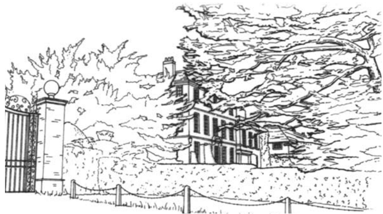
Hadley Hurst, The Common

Assessing each property individually, travelling in a north-westerly direction up towards the village centre, the listed Hadley Hurst is the first focal point after the previously highly vegetated boundary. This encloses some late 20th century properties which are of little architectural merit and are quite highly screened by vegetation. Hadley Hurst (c1700) is a large, three storey, imposing red brick property that neighbours Hadley Hurst Cottages (18th century), which were originally stables for Hadley Hurst. Also listed, they are again on quite a large scale and centred around a tall archway. The next cluster of listed buildings provides an interesting combination beginning with the white stuccoed Georgian property, The Chase, with its central doorway and large broad framed windows; then the more modest Aynho which is a cottage of two storeys with a large central chimney and two front gables. Next is the larger Hurst Cottage of the late 17th and early 18th centuries a two storeyed house of brick, now rendered, slightly less grand than The Chase but not dissimilar; a listed 18th century timber framed barn in the grounds of Monkenmead, set back from the road; The last listed building in sub-area seven is Gladsmuir, a c1830 red brick villa with a shallow roof and deep bracketed eaves. It is notably different in character to the other properties.