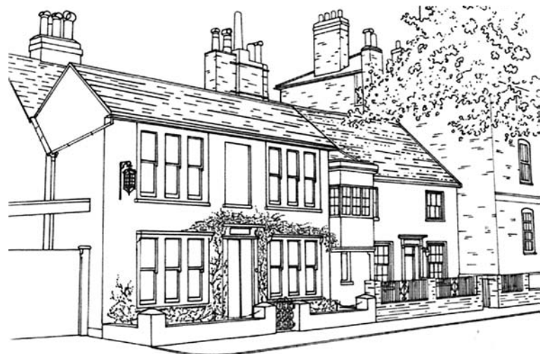
Hadley Cote and The Old Cottage on Hadley Green Road

Hadley Green Road runs along the south east edge of the Green beginning on the fringes of High Barnet (branching off the Great North Road). With the exception of four neo-Georgian houses, there is a string of mainly Georgian listed buildings, along the edge of the Green. This begins with The Grange (mid 18th century red brick), Ossulston House (1764, red brick) and two cottages (The Old Cottage and Hadley Cote) with early 19th century fronts. These properties have an attractive outlook onto “Joslin’s Pond” and are situated next to an open space that provides long views and an access route to King George’s Field beyond.