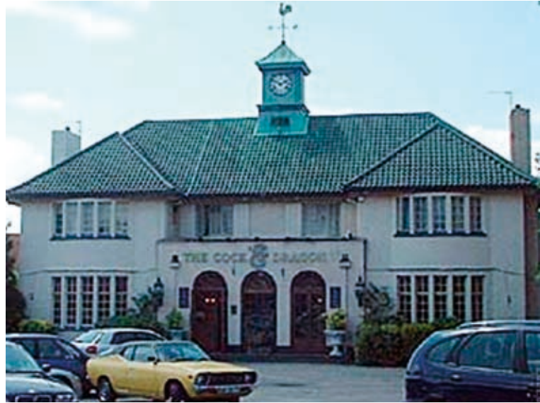
Cock and Dragon public house

in the 1970s. Perhaps the building's most remarkable features are its green pantiled roof and clock tower, which is topped by a large weather vane. It has quite a large front car park which had formally been used as a terminus for the no 29 bus!