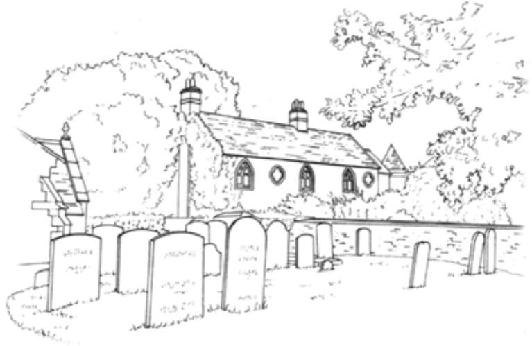
Access through the church graveyard leads to the Common on the other side. Pagitts Almshouses are in the background.

around the church and churchyard and it is possible to walk through to the other side, providing access to the Common.