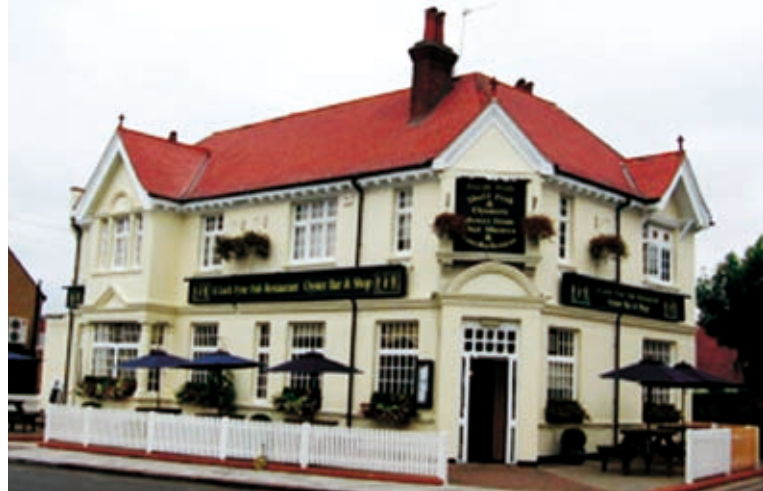
No 12 Hadley Highstone (Locally Listed)

Highstone) providing views from Hadley Highstone. The older terminating building is gated, which detracts from the scene.