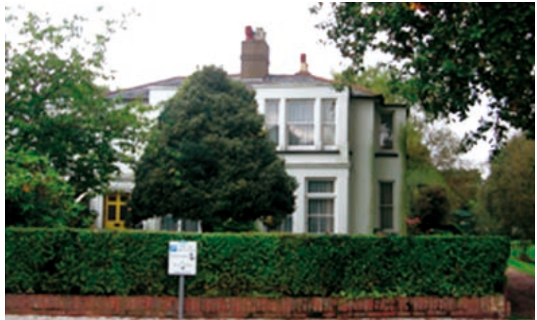
Green View borders Hadley Green

this part of the route so attractive. The first property on Hadley Green, Green View, is a focal point. This is an attractive white stucco Georgian house which would seem to mark the beginning of varying styles of development from Hadley Green to Hadley Highstone.