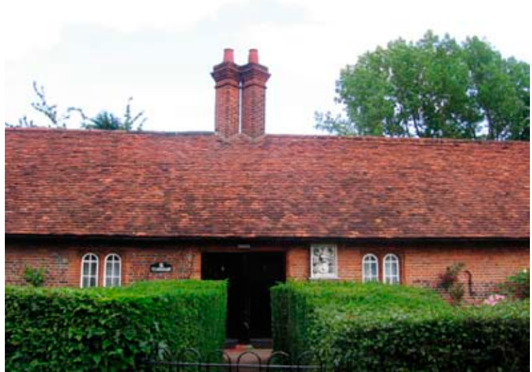
Wilbrahams's Almshouses on Hadley Green Road

Other land uses include commercial, educational and institutional establishments. There are two schools in Camlet Way, (Mount House School), Monken Hadley Junior Mixed Infants and the Mount House Convent secondary school for girls. An old people's home in Dury Road, Hadley Bourne (St Martha's Convent School) in Dury Road and the Wilbrahams Almshouses and Pagitt's Almshouses on Hadley Green Road.