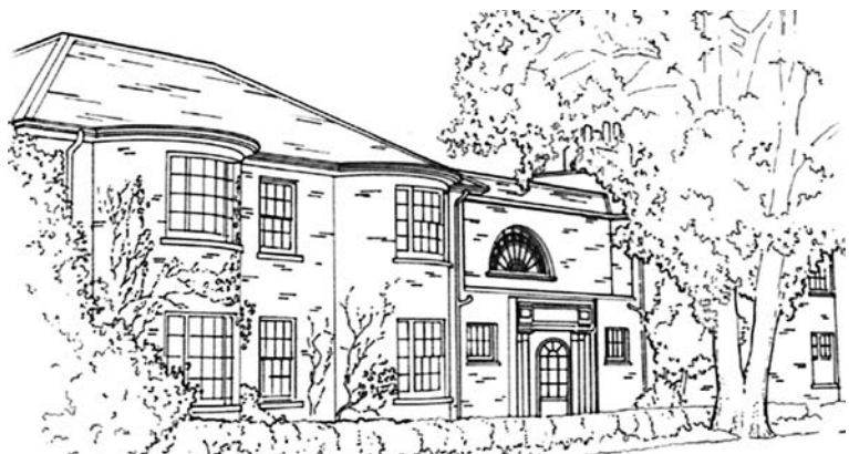
Old Fold Manor Golf Club House, Old Fold Lane

Taylor's Lane leads off Hadley Highstone (on the west side), around to Old Fold Lane and contains pretty, modest cottages notable as a group and built in close proximity. There is a strong front boundary. Nos. 7 and 8 are locally listed. There is a strong front boundary. Nos. 7 and 8 are locally listed. Old Fold Lane contains a group of attractive Victorian terraced properties on one side only, facing the high boundary vegetation of the golf course, although, there are glimpsed views beyond. This part of the Conservation Area is characterised by restricted road widths and a tighter urban grain. This opens out at Old Fold Close and further more onto the Green itself. Old Fold Close branches off from the lane and contains handsome locally listed properties. They are quite enclosed by a strong boundary of trees and shrubs with glimpsed views of the houses from all angles. There are direct views into the close from the lane. On the opposite side is the listed Old Fold Manor Golf Club House, two houses of c1820. It was adapted in the early 20th century by Charles Weymouth as a clubhouse with an added central link with four columns. Next door, the listed Old Ford Manor House of c1750 is also a fine stuccoed five bay building which can be glimpsed from the lane through its boundary vegetation. There are the remains of a moat to the west. The Manor faces (although set back) onto the Green and there is a path which leads invitingly onto the Green along the front of the Manor.