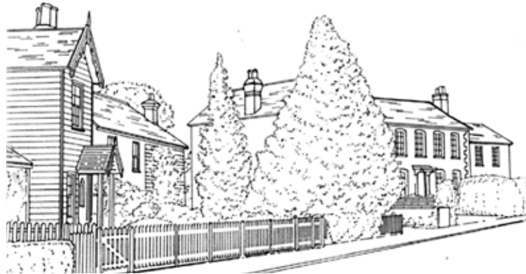
Properties along Dury Road

(nos 4 -18) although the former group are of a superior quality. There are glimpsed views up the cul-de-sac containing nos 21 and 23, which are small, attractive cottages. No. 29, Thorndon House, is early Georgian. Nos 27 and 31 are of a similar date. From the top of Dury Road there are views as far down as nos 27 to 31. After this there are long views all the way down to the Wilbrahams Almshouses on Hadley Green Road to which the eye is naturally drawn. 39 Dury Road, Stoberry Lodge (c1830) is a stucco villa, nos 41- 43, Hadley Bourne, formerly St Martha's Convent (listed), is of red brick, mid-to-late 18th century and provides a focal point coming up Hadley Green Road or Sydney Chapman Way.