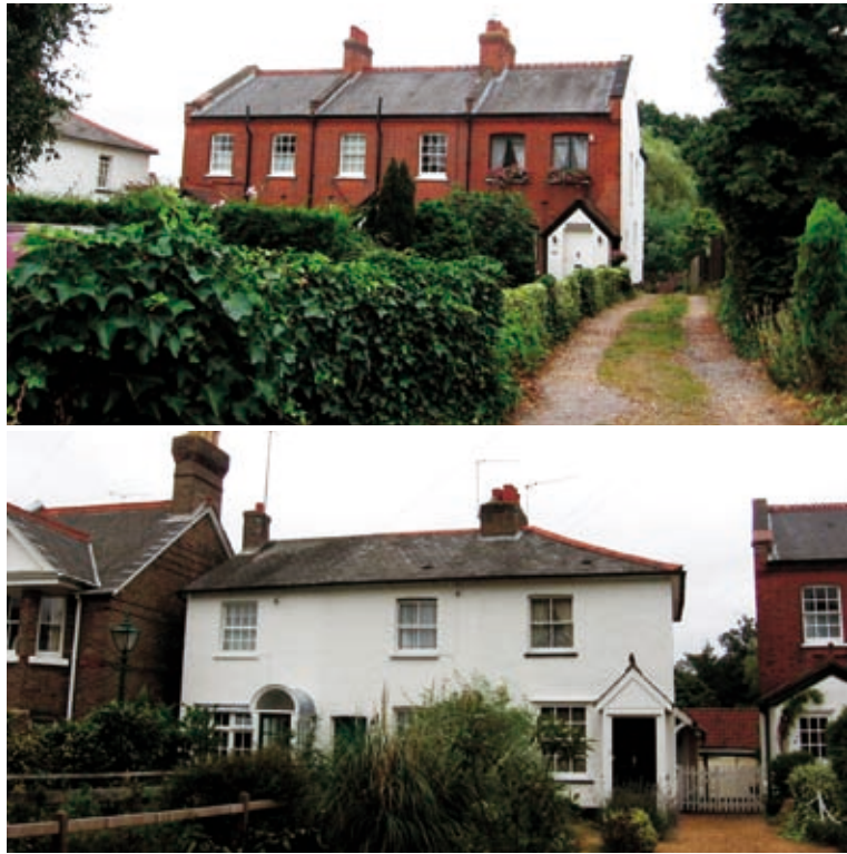
Cottages lining Hadley Highstone

There are six primary land uses within the Conservation Area: residential, religious, institutional, commercial, recreational and agricultural.