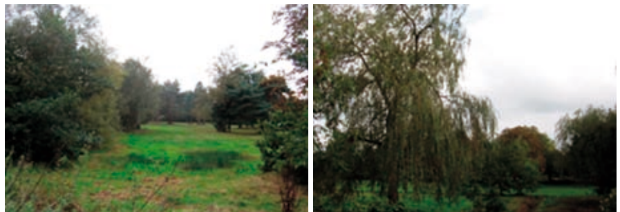
Views onto Hadley Green

7.2.1 The Green There are impressive views from all sides into and across The Green, which provides direct views for houses facing onto it. Hadley Green is quite thickly tree lined next to the main road and both sides of the Green have scattered vegetation which provides a semi-wild habitat. It is an area consequently designated as a Site of Metropolitan Importance for Nature Conservation due to its ecological maturity. Paths throughout the Green are particularly used by local residents and visitors, for jogging, walking or exercising dogs. At the northern end of the Green (Dury Road side) there are two ponds which provide a particularly picturesque setting. From Hadley Green, there is a path that leads along and around the back of Greenview, which ends at the pond.