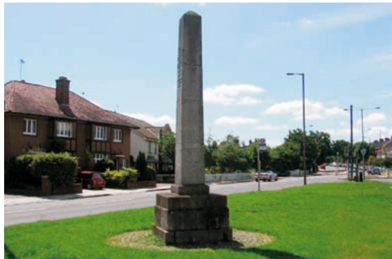
The Highstone Obelisk

Hadley Highstone (part of the Great North Road). The Highstone obelisk is at the junction of Kitts End Road and Hadley Highstone. The stone, as noted earlier, commemorates the Battle of Barnet, was moved here in 1840 from its original position some 200 yards further south.