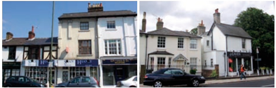
Properties on the High Street

applies to both sides of the High Street. There are three attractive properties which lead off behind nos. 200-204 High Street and provide glimpsed views from the road and interesting focal points.