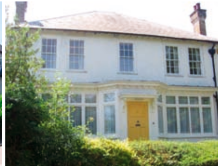
No. 11 The Crescent

With perhaps one or two exceptions the properties retain many original features and are well designed and maintained. Most notable perhaps and unusual in style is the locally listed Monkenhurst (no. 15), an 1880 romantic Gothic building of three storeys with a tower over the main entrance and attractive stained glass windows. Some local people refer to this as “Spike Milligan’s house” as he resided here for a period of time. The tower roof can be viewed journeying up Bakers Hill. Nos. 1 and 2 are also fine Victorian properties. The last property on The Common is an uncharacteristic modern block of flats for the Conservation Area called Hadley Heights. The road named Hadley Common then becomes Bakers Hill. Hadley Wood continues on the north side of Bakers Hill while on the other side, there are two private roads leading off Bakers Hill (one of them is named The Spinney) which contain later neo Georgian houses. There is one elegant exception called Witchings, a three storey rendered Victorian house formally known as Gothic Farm.