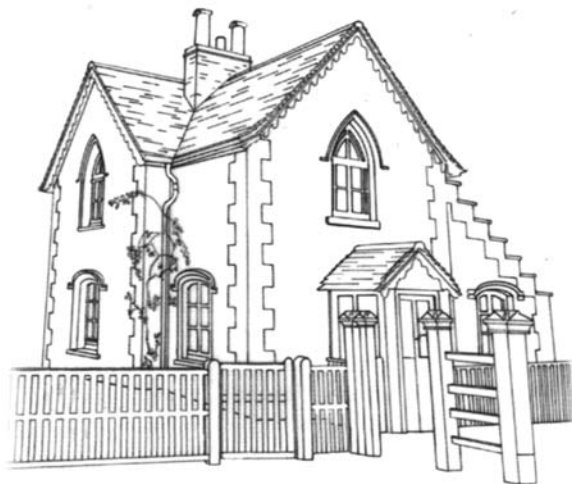
The Gate House, Monken Hadley Village

The houses which lead to the church after Hadley Bourne (area three) include on the one side, two large, neo-Georgian houses (The Cedars and Little Pipers) next to The Grove (listed) which are all set in their own walled grounds. These properties are quite enclosed and set back behind vegetation and tall brick walls, although views of the houses are possible through their front gates. Beacon House and Grove Cottage are nestled in between The Grove and the Church and are highly attractive timber framed buildings behind later brick facings. The church's other neighbours are the impressive Pagitt's almshouses, built of flint in a Gothic style alongside the Gate House and Rectory buildings. The almshouses are not the originals endowed in 1678 in Charles II's reign by Justinian Pagitt nor on the original site. The left hand two thirds was built in 1822, the remaining third in 1849 and a smaller red brick addition in 1961. The Gate House is considered as being the beginning of Hadley Common and is an early Victorian house with listed timber barred gates across the road acting as a pinch point and traffic calming measure. The Rectory buildings are also of a Gothic appearance in red brick and are locally listed.