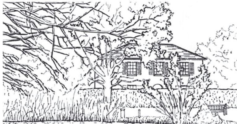
One of the ponds on Hadley Green