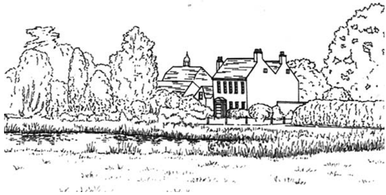
Large Georgian residences were built around the Green and Common

Monken Hadley is still very green and leafy in character and remains at a low built density. Its special character stems from development in the 18th and 19th centuries. Large Georgian houses with impressive gardens were built as residences for the London gentry of the day to escape the coal-fuelled atmosphere and unhealthier conditions of London. These surround the Green and edges of the Common. The scattered groups of mature trees are vestiges of the rural outlook these properties once enjoyed.