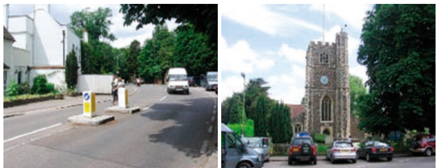
Traffic bollards and parking outside the church detract from the village scene

7.5.3 Intrusions/opportunities for improvement Informal car parking in front of Beacon House/the church does little to enhance the village centre or the setting of the church. Monken Gotthard, the property next to the Church Cottages, is an unobtrusive building within this location but of no great architectural merit. Its garage fronts the road and is not a positive feature of the village and actually detracts from the house itself. The volume of traffic that passes through the village centre, although slowed by the gates at the entrance to The Common, can detract from the overall quality of this rural environment. The new Hadley Lodge, which replaced the earlier listed building which burnt down in 1981, is a little too robust and self assured for many tastes. The recently erected traffic island outside the church, severely detracts from the appearance of the village centre.