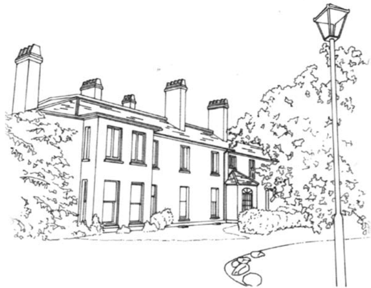
The locally listed West Farm Court