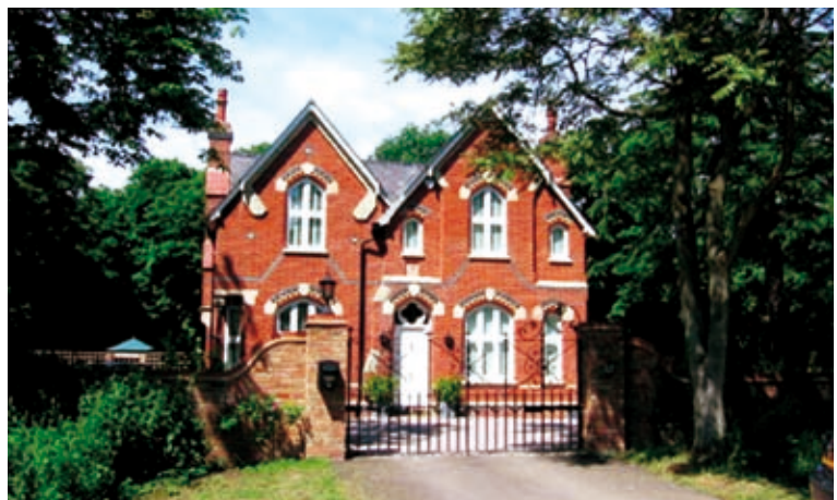
Windmill House set back off Hadley Green

Sydney Chapman Way divides the eastern side of the Green while the built part of Hadley Green West, (which is included in area three) provides the western boundary to the Green. Dury Road and Hadley Green Road provide the northern and eastern boundaries respectively. The locally-listed Windmill House can be accessed from the western side of Hadley Green. Windmill House is an attractive but restrained Victorian Gothic style which can be glimpsed from the main road through the mature vegetation of the green. On closer inspection, the house appears to have been refaced/bricks cleaned or possibly rebuilt. There appears however to be no planning records of this.