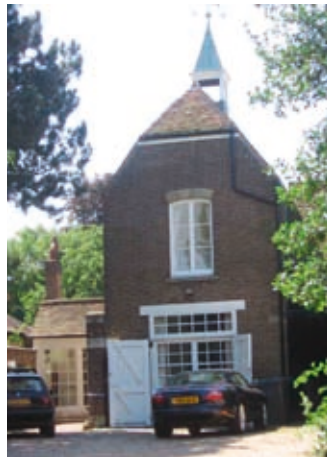
The Chase Cottage