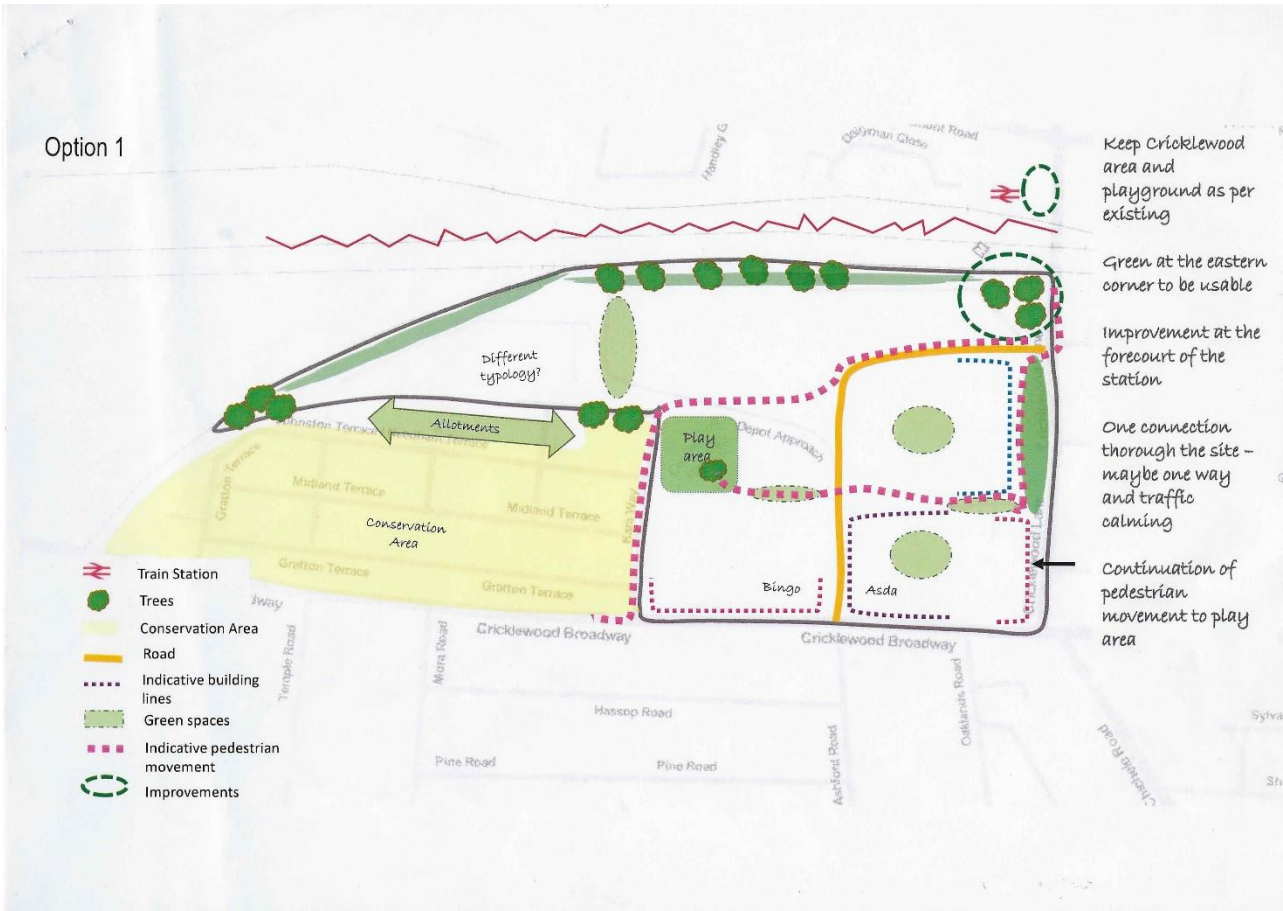
Figure 12: Option 1 from CRTRA Meeting with LPA 6 August 2019