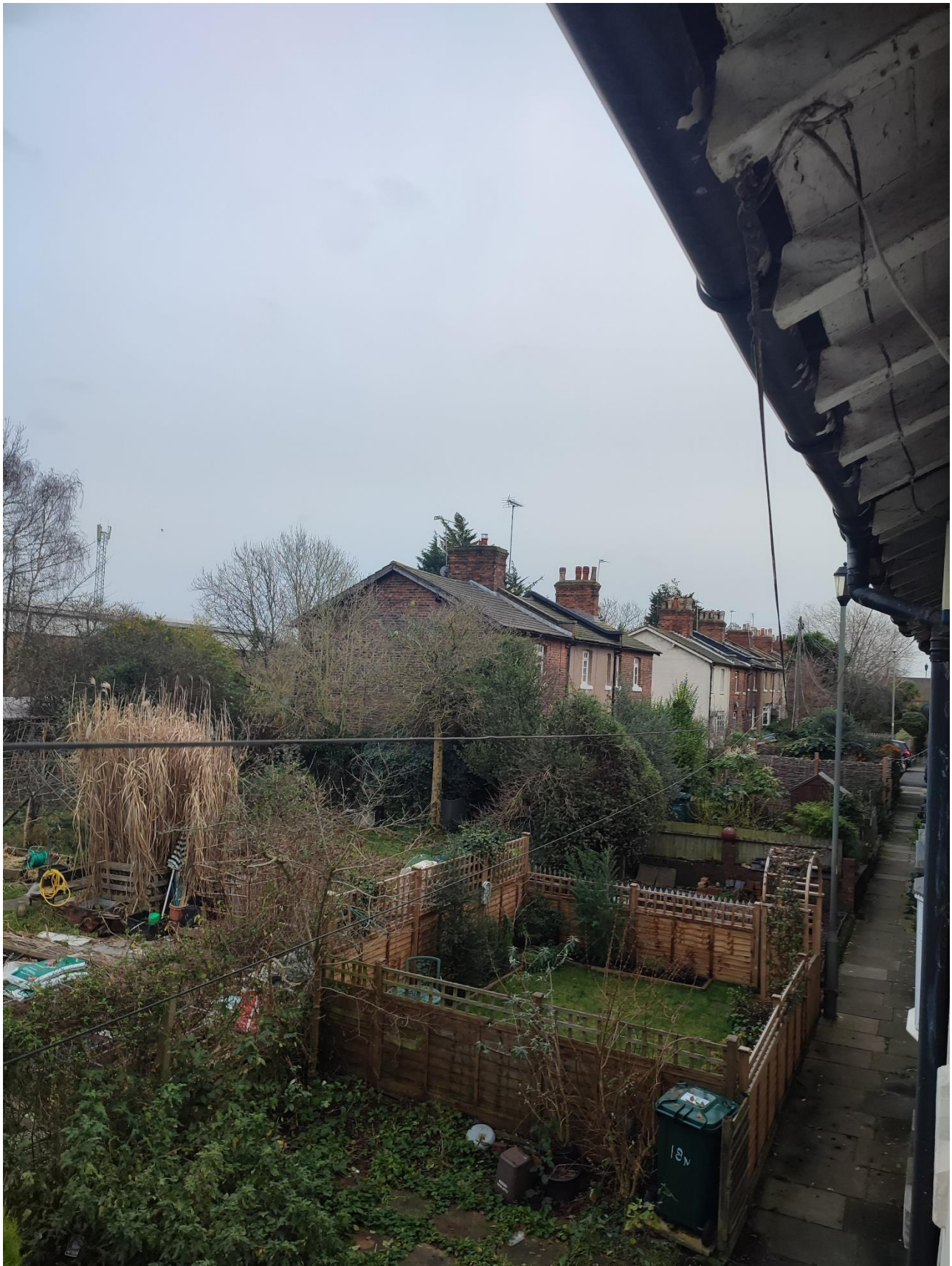
Figure 4: Front bedroom, Needham Terrace