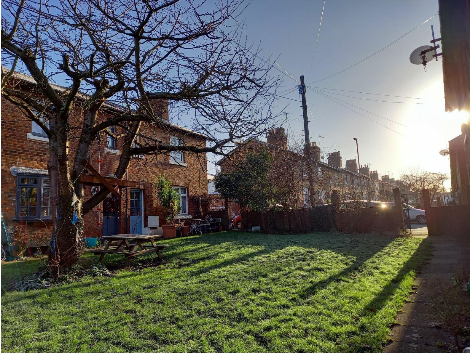
Figure 8: Outside 25 Midland Terrace