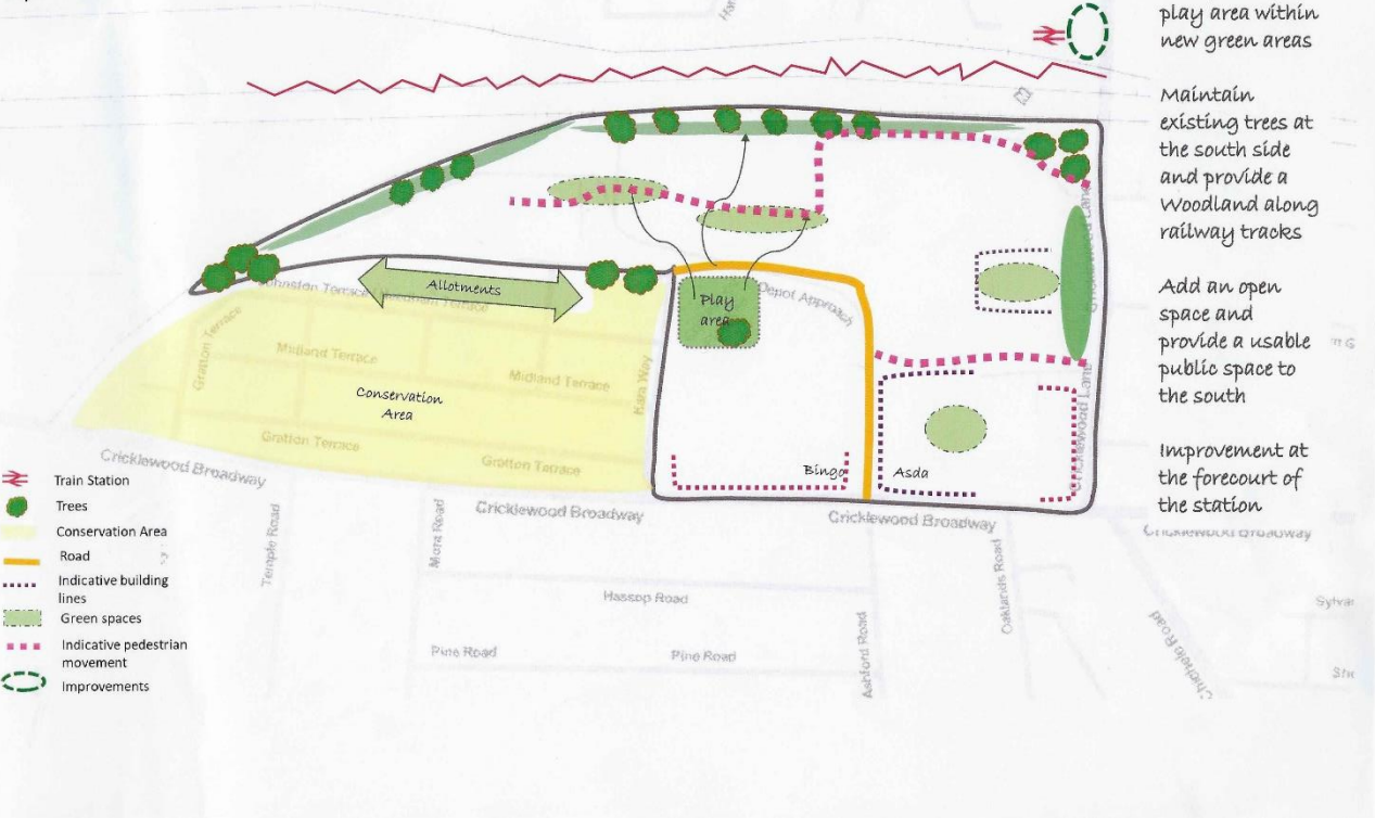
Figure 13: Option 2 from CRTRA meeting with LPA 6 August 2019