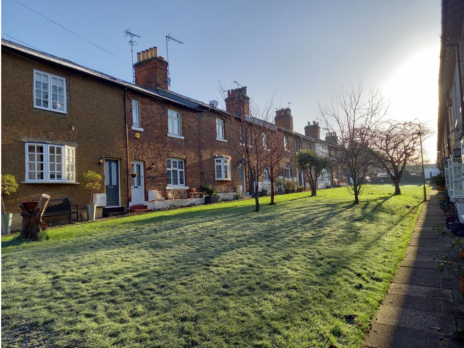
Figure 7: Front ground floor, 22 Midland Terrace