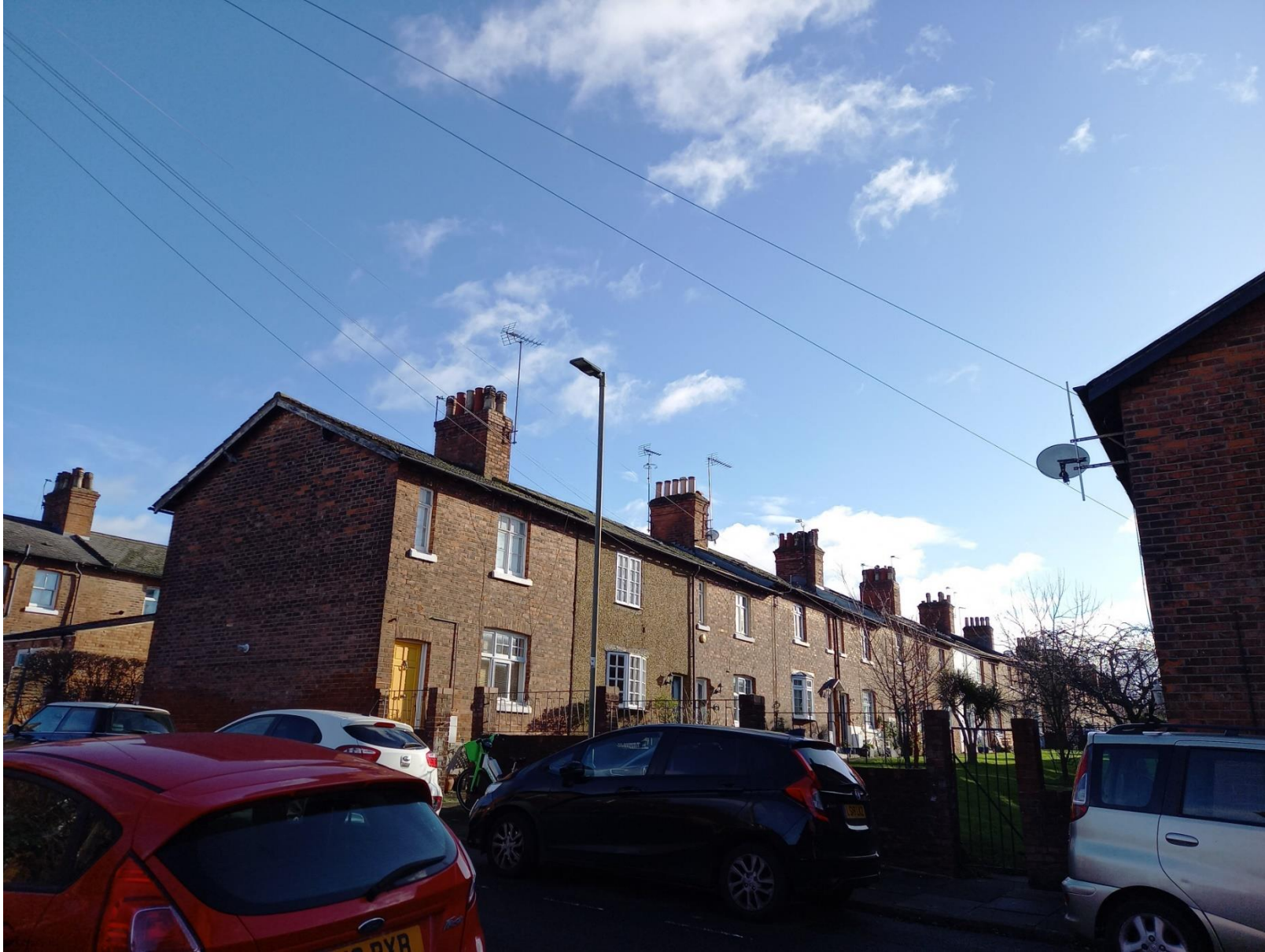
Figure 6: Allotment Way