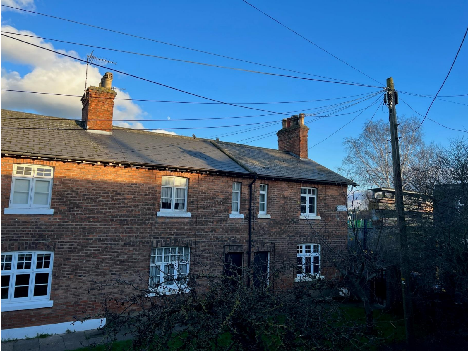
Figure 2: Front bedroom, 3 Midland Terrace