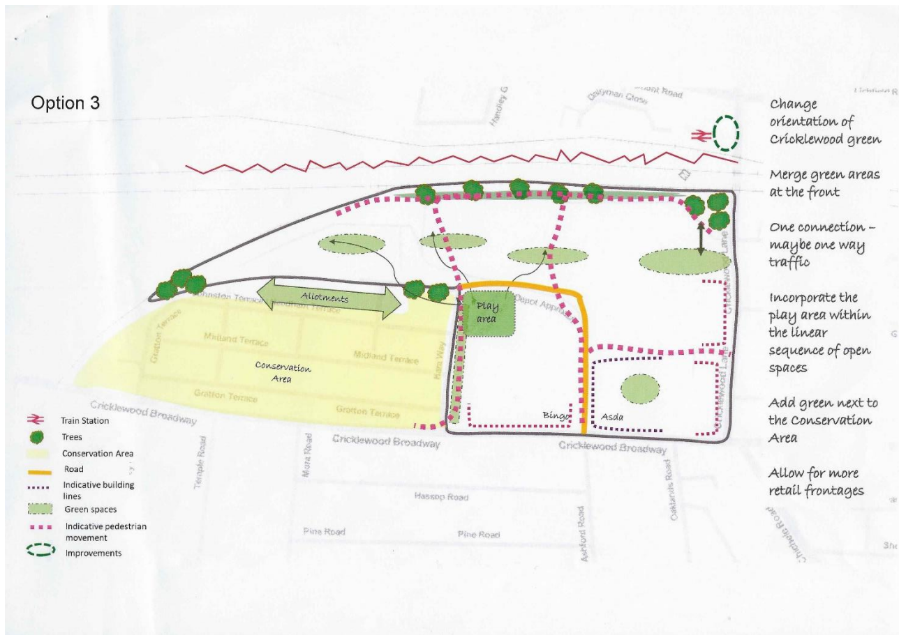
Figure 14: Option 3 from CRTRA meeting with LPA 6 August 2019