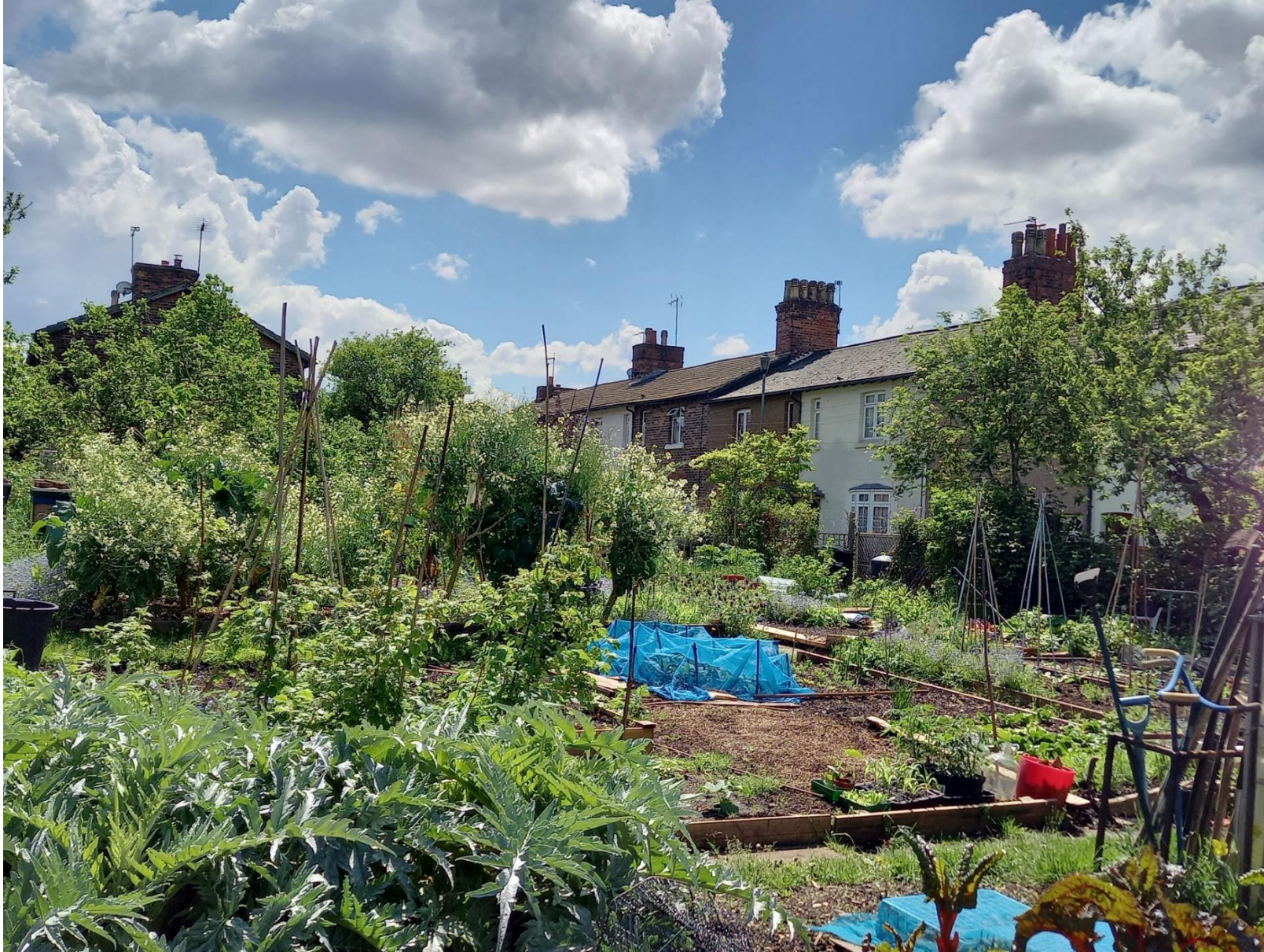
Figure 10: Allotments, towards Campion Terrace and Needham Terrace