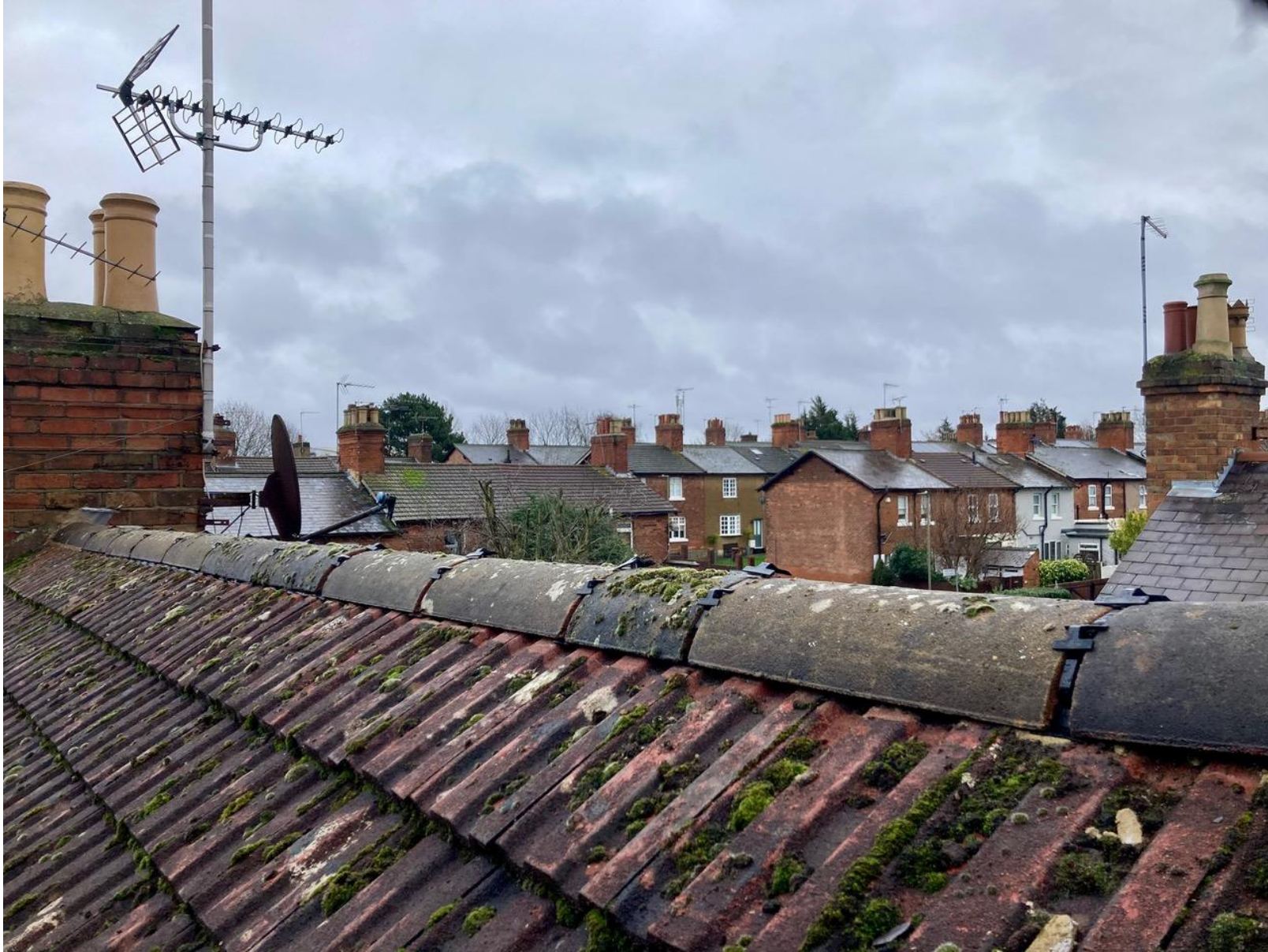
Figure 5: Back bedroom, 25 Gratton Terrace