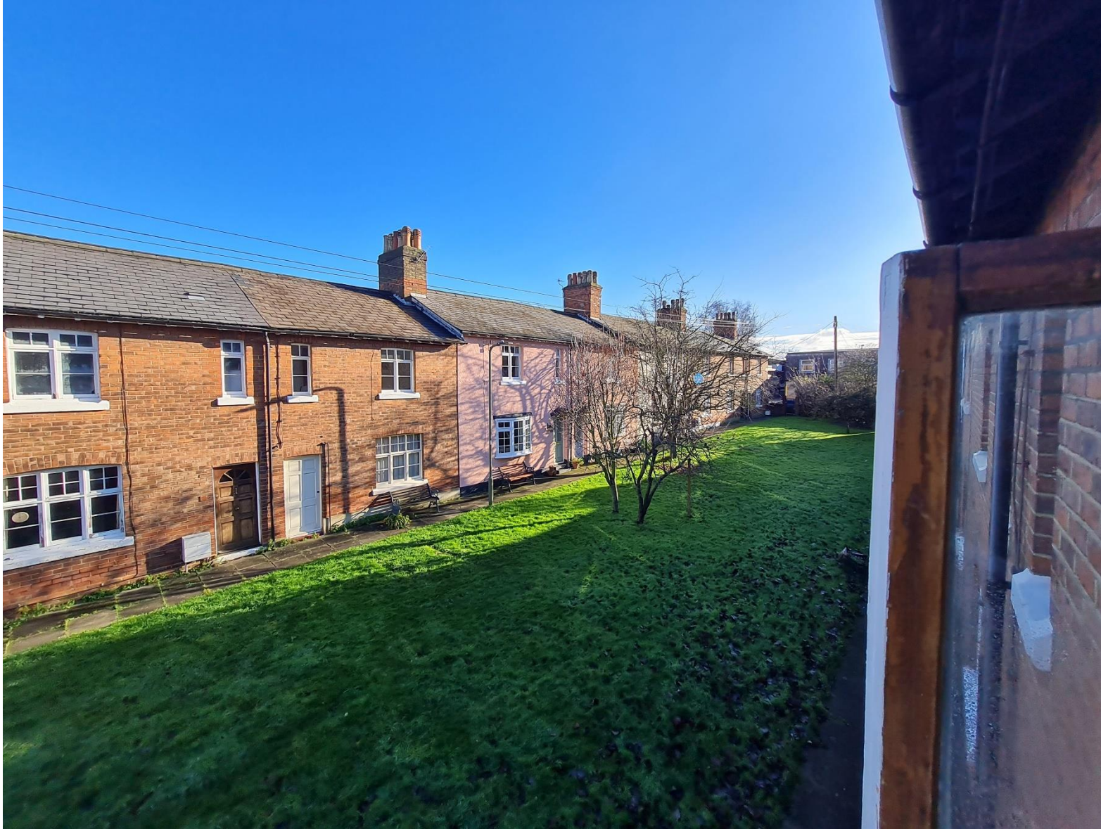
Figure 3: Front bedroom, 8 Midland Terrace