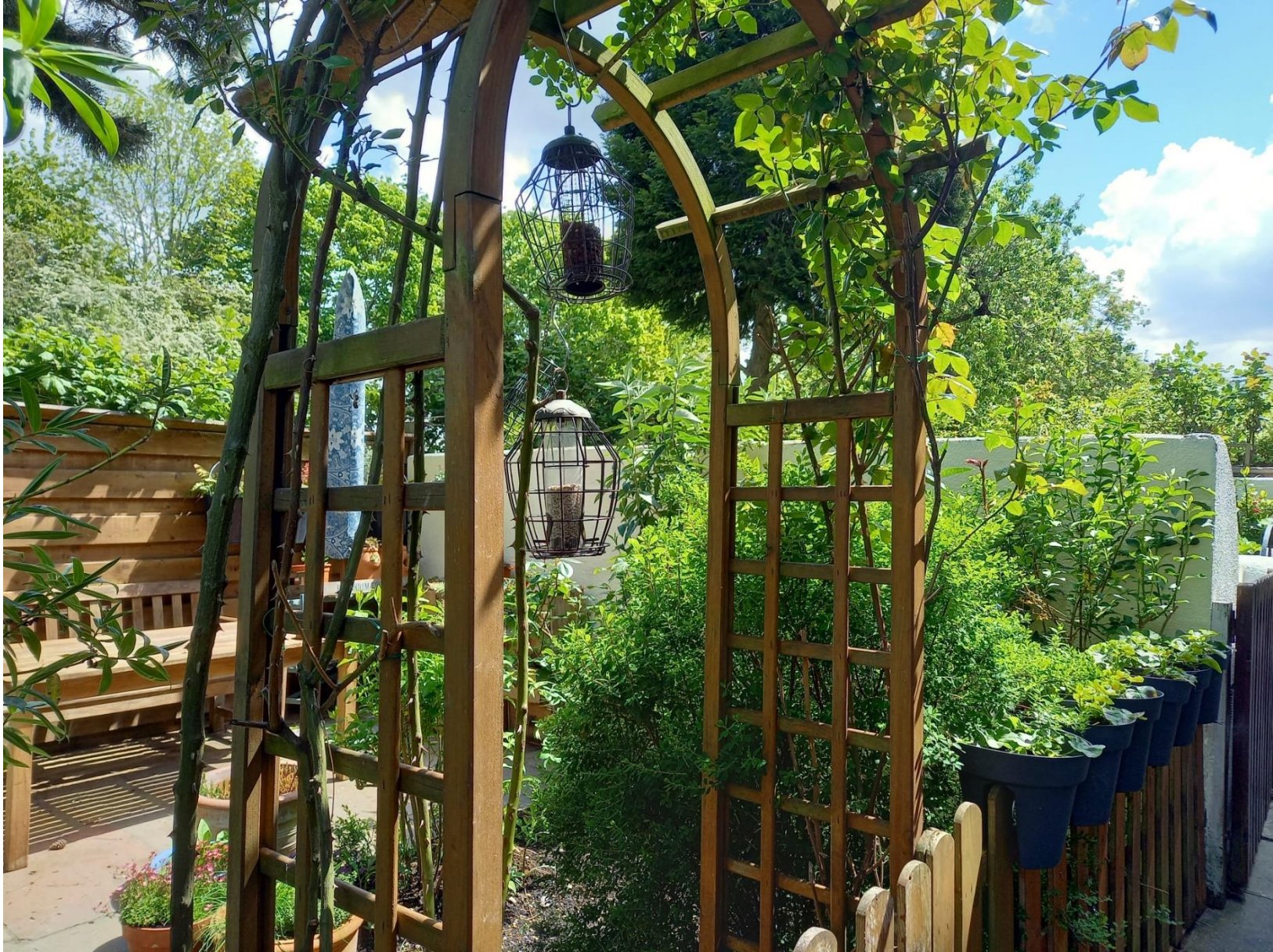
Figure 9: Garden, Needham Terrace