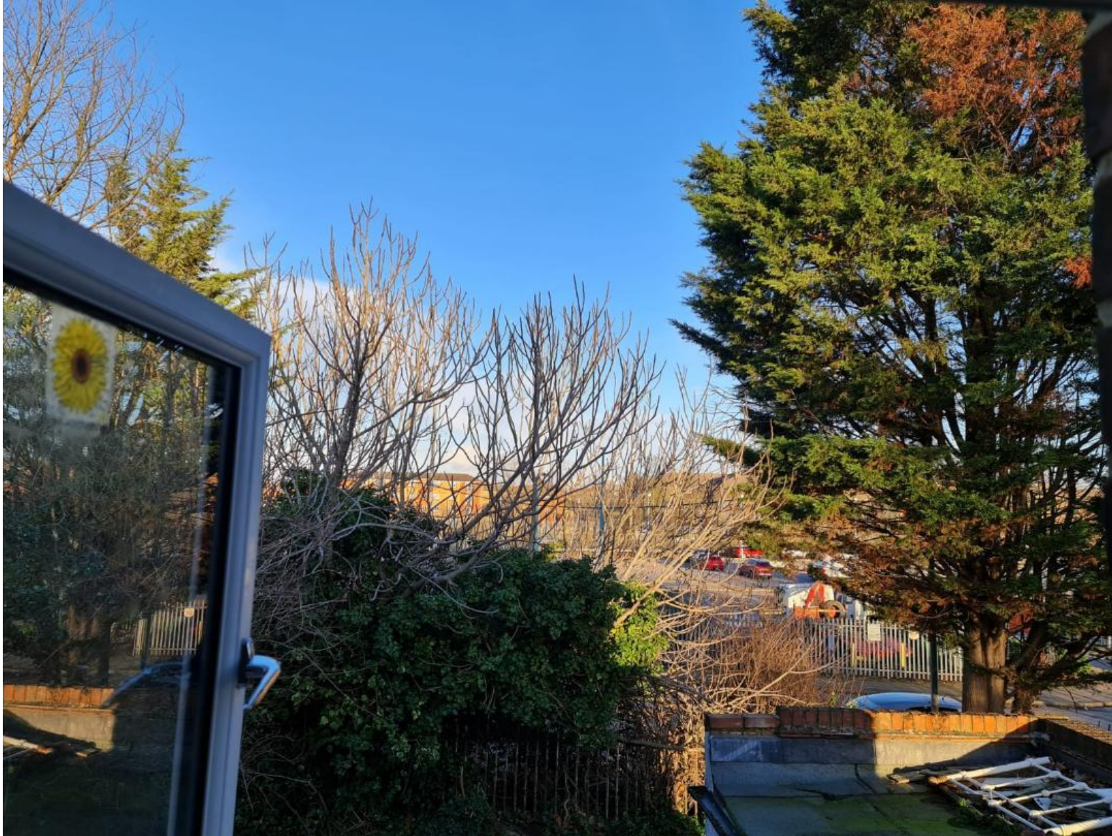
Figure 1: Back bedroom, 1 Campion Terrace