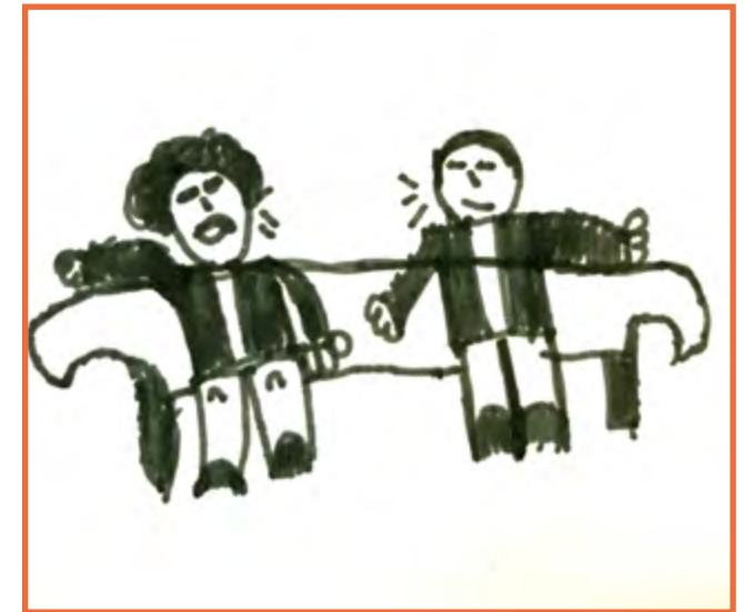
Coproduced by JD and YB as part of their Reparation-10/06/2019